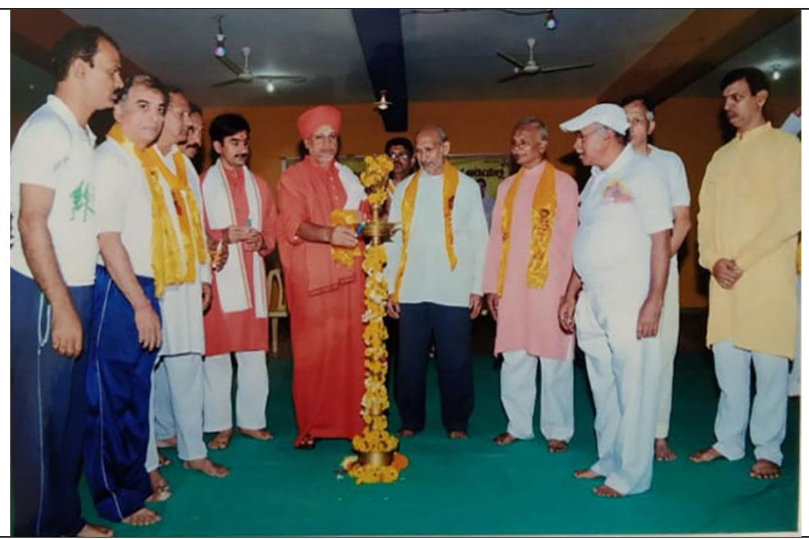
Inaugural function of Yoga Program by Sahyoga Teachers' Training Camp.