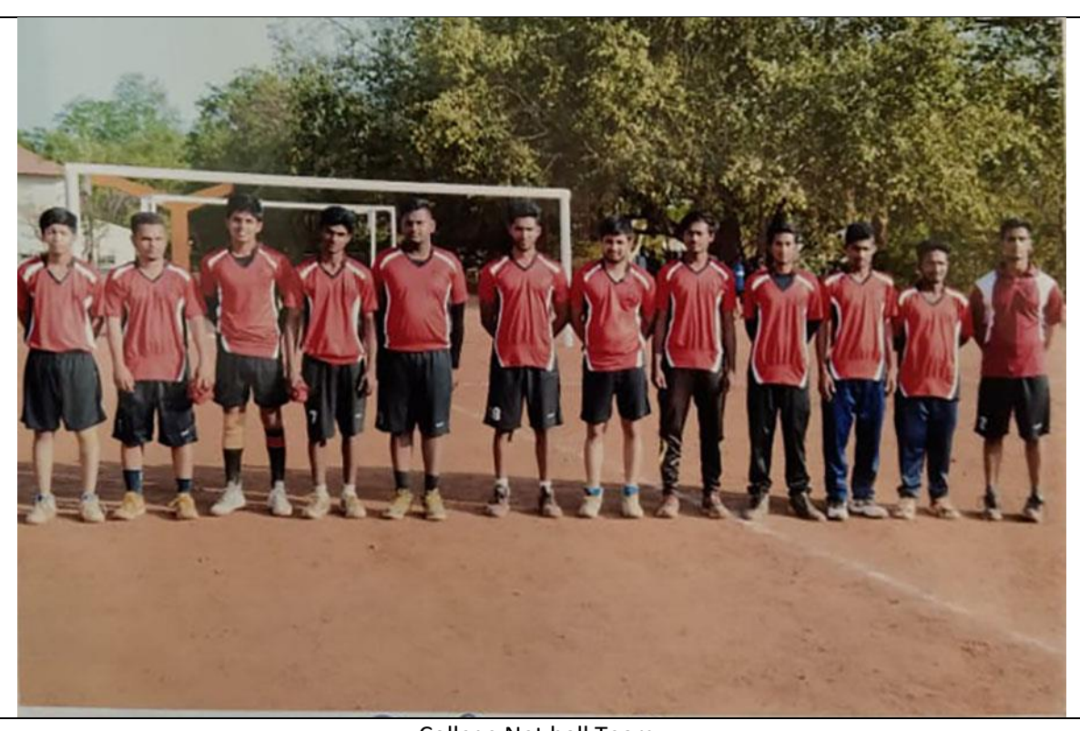
College Net ball Team.