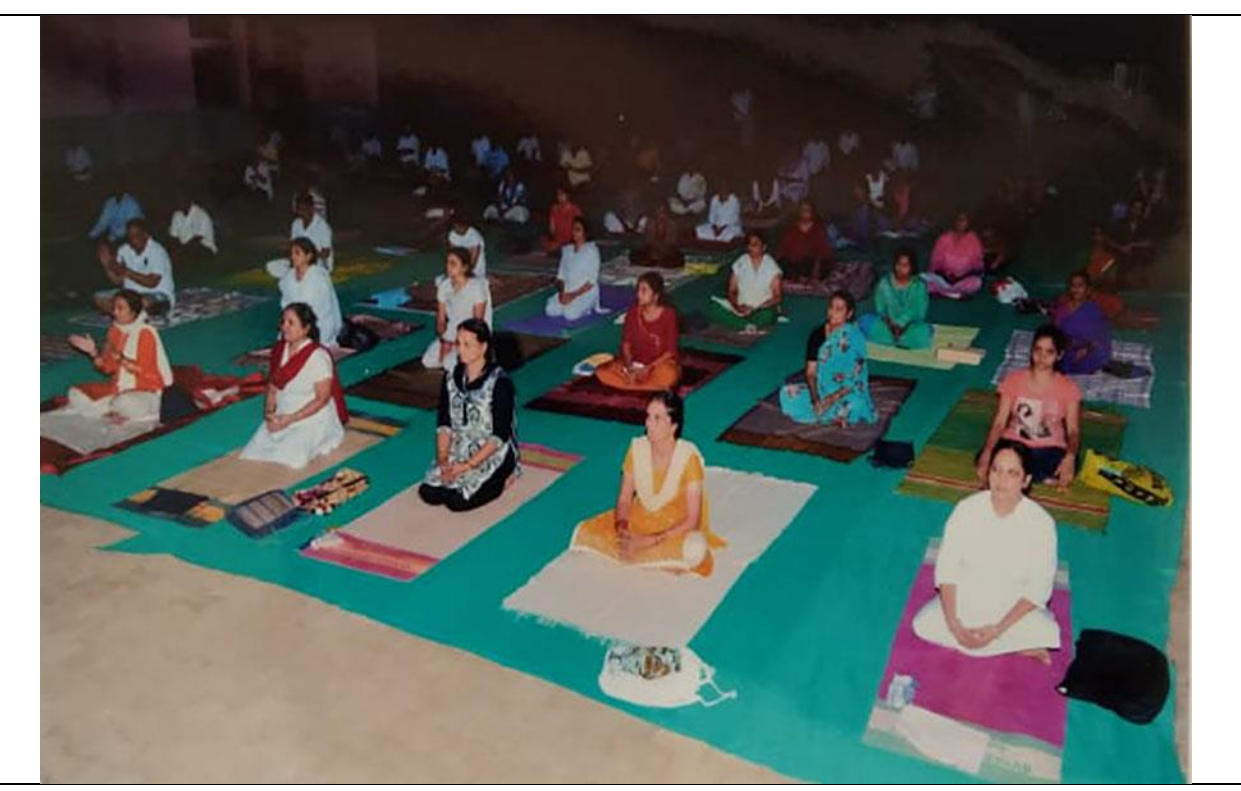
Volunteers listening to the rules of Pranayam.