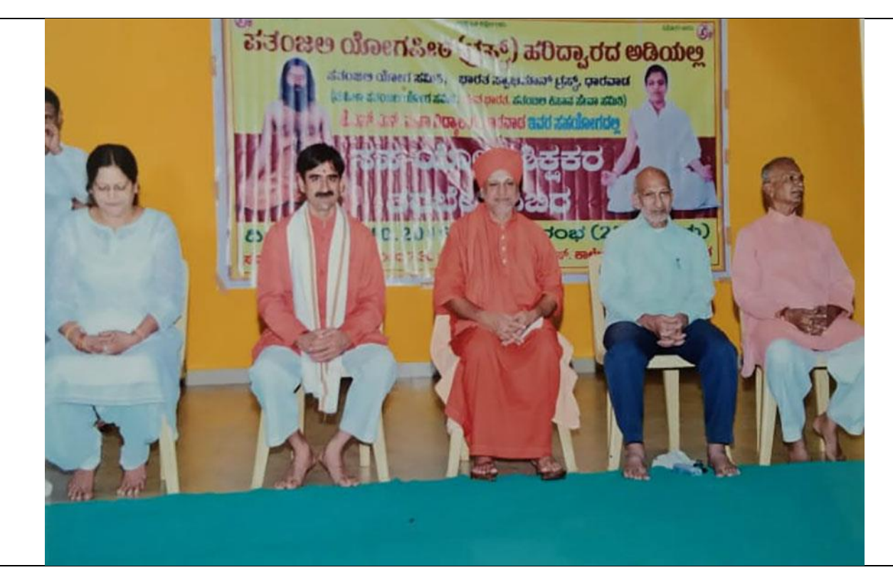
Patanjali Yoga Trust Haridwar and JSS Institution organized the Yoga Program by Sahayoga Teachers' Training camp.