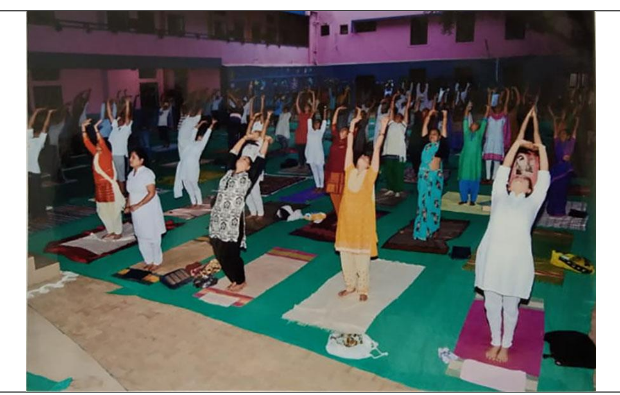
Volunteers in the practice of Yoga.